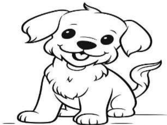
Illustration by Alamy